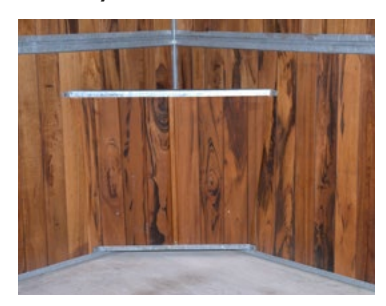
Low Hay Feeder