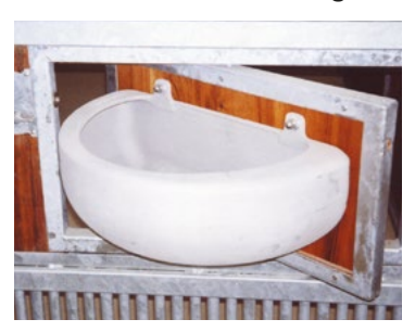
Cast Aluminium Swivel Manger