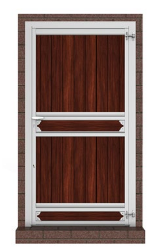
Majestic Lockable Door