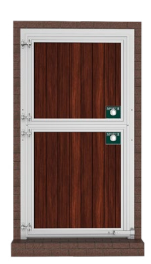
Top and Bottom Set