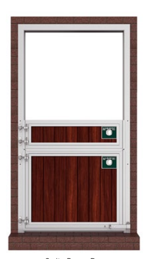
Split Pony Door