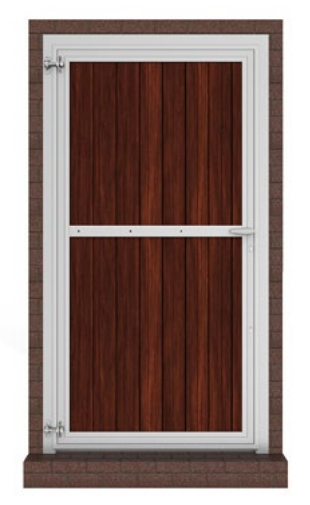
Full Lockable Door